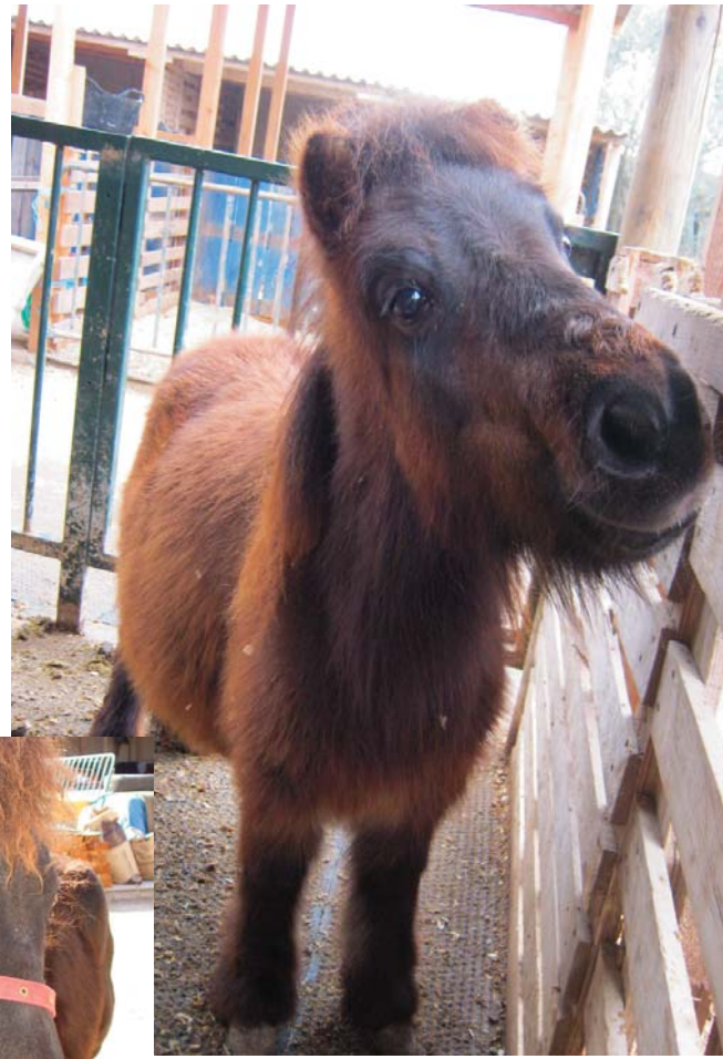
Left: Samson on arrival at the rescue centre Above: Luscious long locks