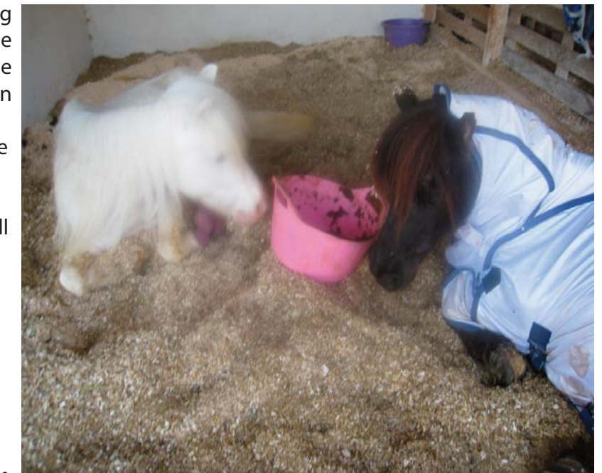
Princess sharing lunch with best friend Cookie

We were all heartbroken to lose her, this brave little girl who had suffered so much pain in her life but who gave so much affection to all around her. Princess left such a lasting impression that she will never be forgotten. There is never a day goes by at