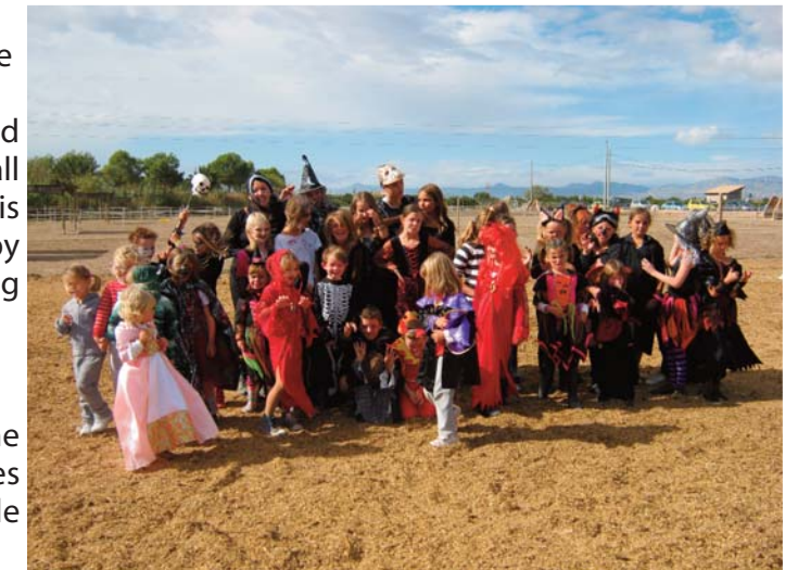
Halloween party fun

If you would like to book a place on one of the days or require any information please email riding@easyhorsecare.net or call Sue on 652 021 980