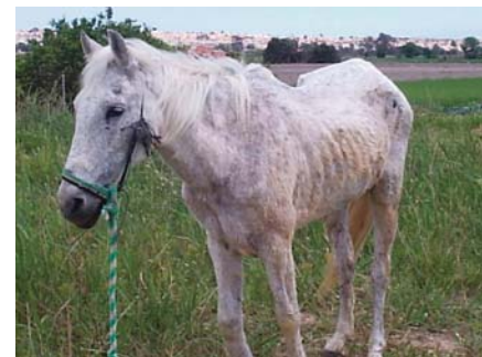
Chance's home before being rescued

made a great recovery and quickly made friends with everyone here. She soon became the Star, acting as the outdoor meet- and -greet girl, she roamed the centre "free range" escorting the tours around the paddocks and soon becoming the Star of the Pony Club. She was an honorary member and joined in with all our activities.