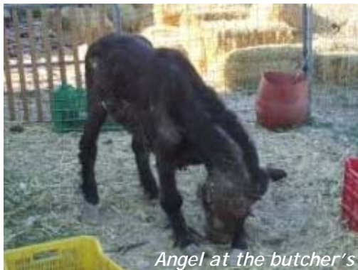
Angel at the butcher's