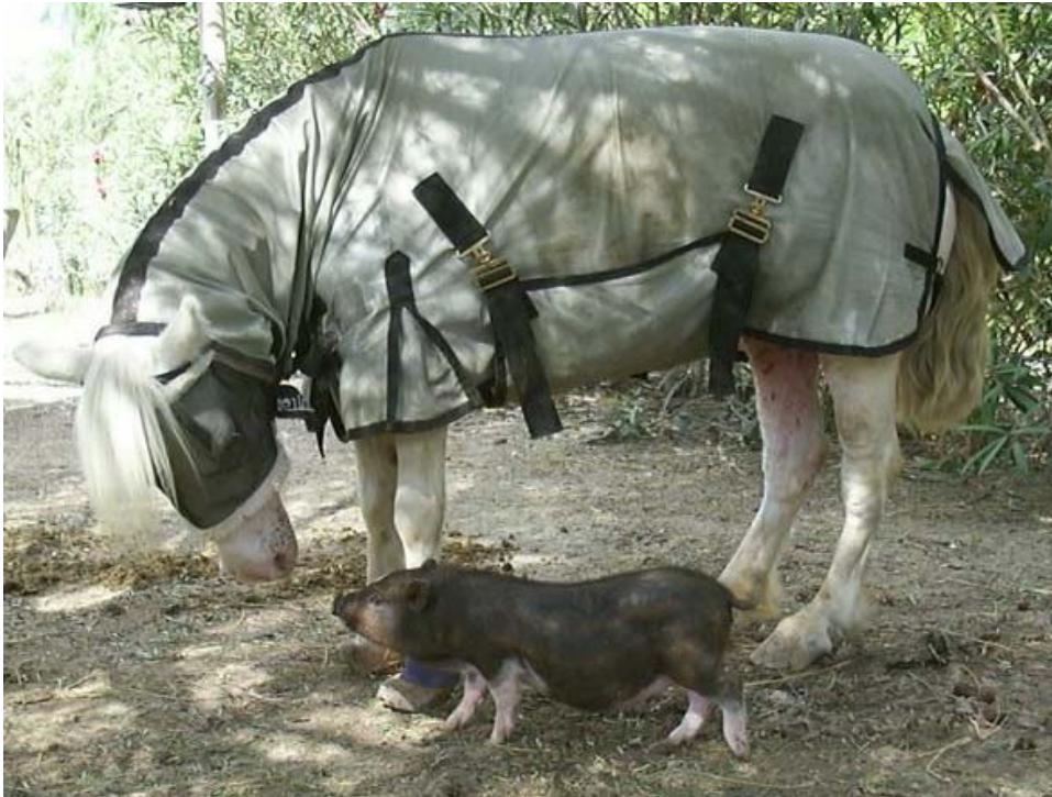
Bottom: Princess nuzzling Cookie