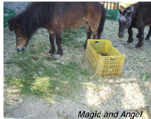
Magic and Angel