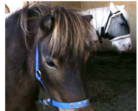
Below: Magic today lives very happily at the centre